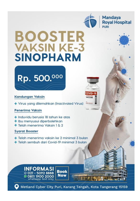
Mandaya hospital Poster

The provision of boosters to healthcare workers is only 54.30% even though it has been running for two months. There is also still only 18.78% of the elderly who have been fully vaccinated. Vaccinations must be completed for vulnerable groups first. WHO also recommends not to give a third vaccine, so that vaccine equity is achieved.